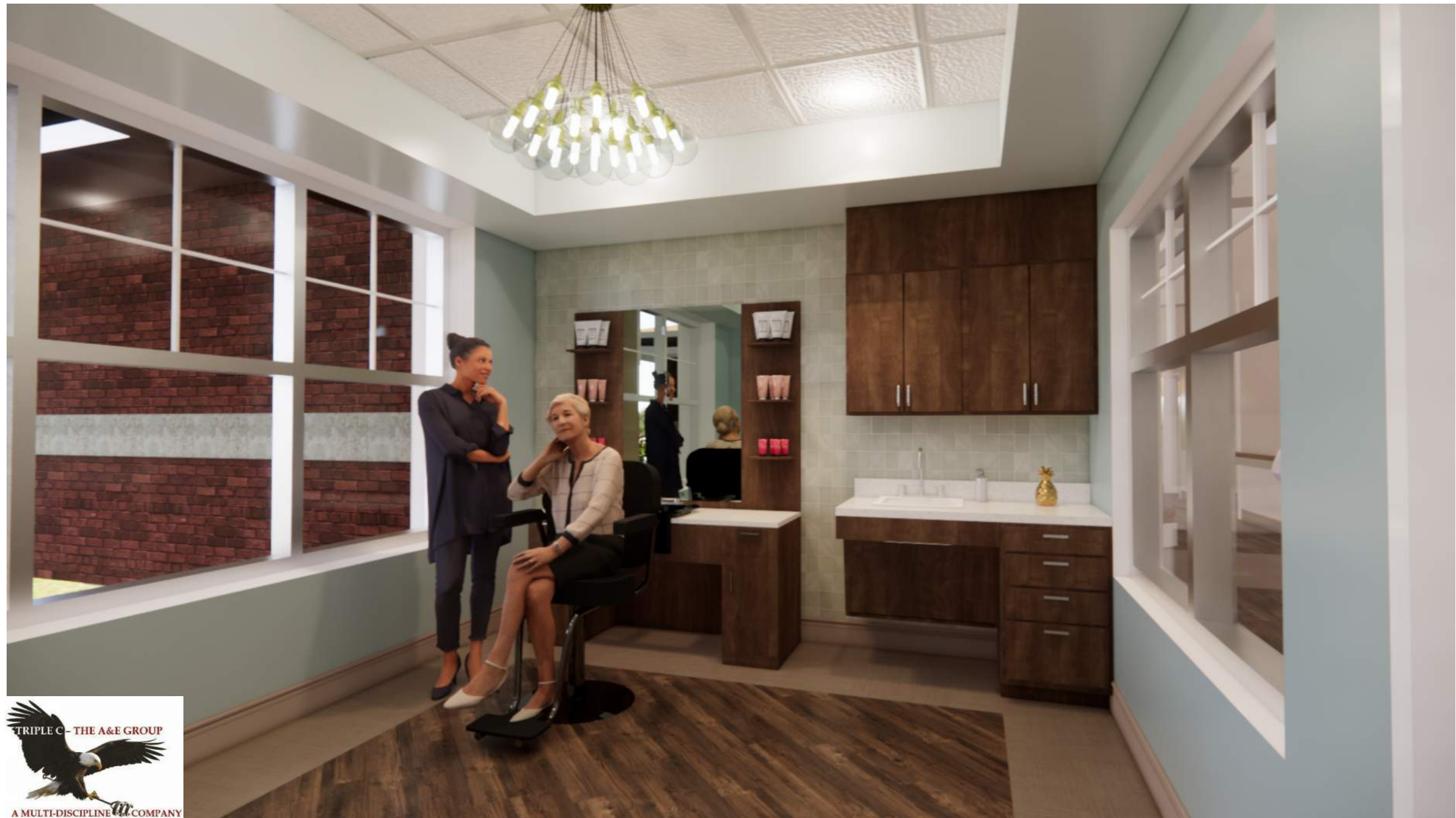
VIEW 1: SALON