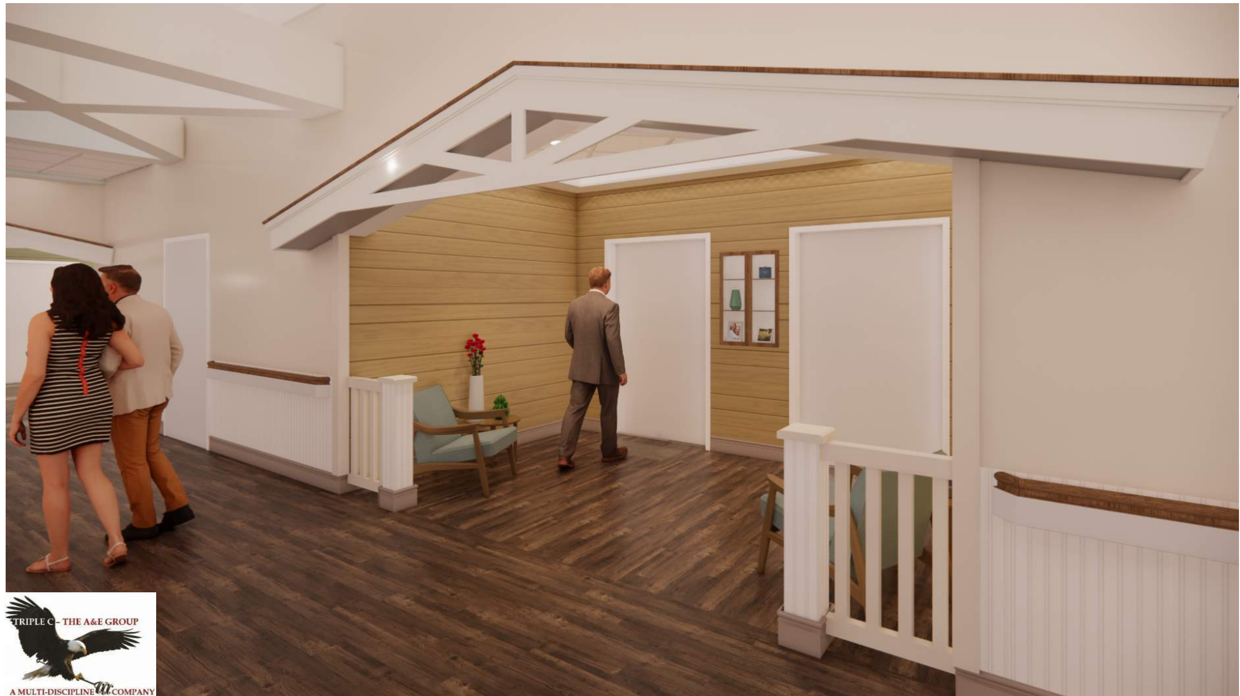
VIEW 4: TYPICAL RESIDENT ALCOVE