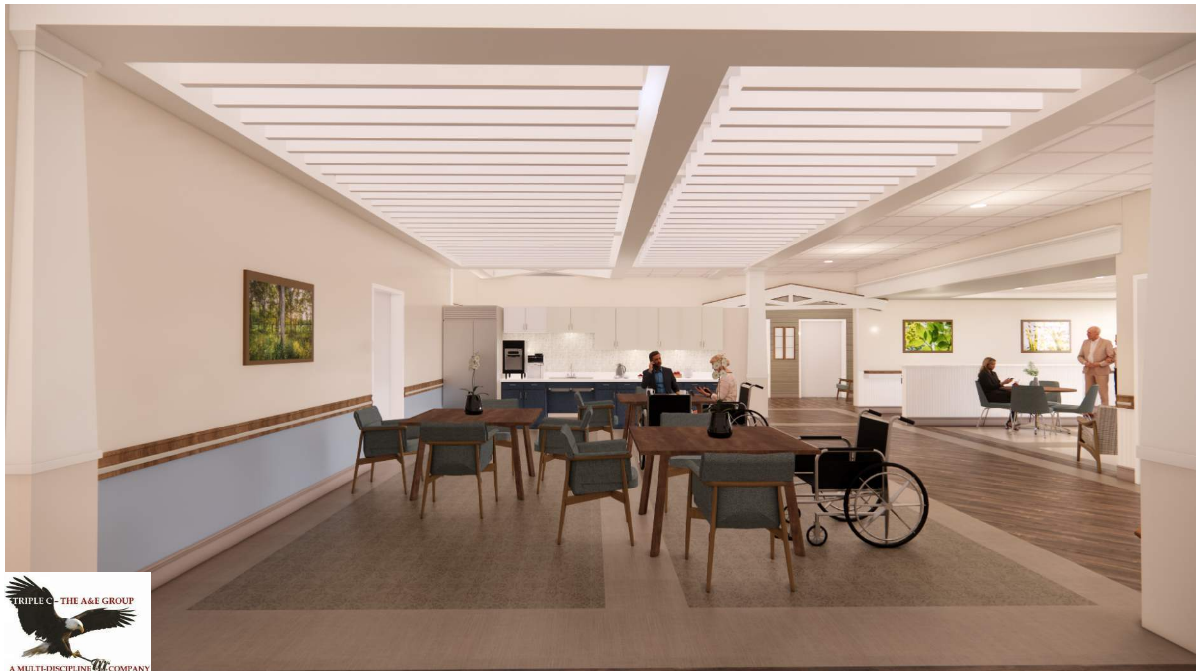
VIEW 8: TYPICAL RESIDENT DINING/ LIVING ROOMS