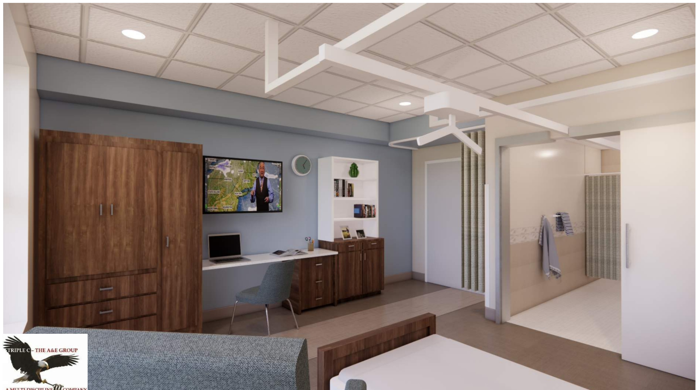
VIEW 6: TYPICAL RESIDENT BEDROOM