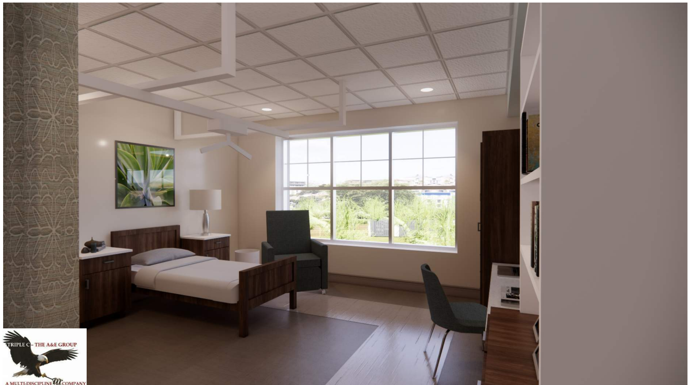
VIEW 5: TYPICAL RESIDENT BEDROOM