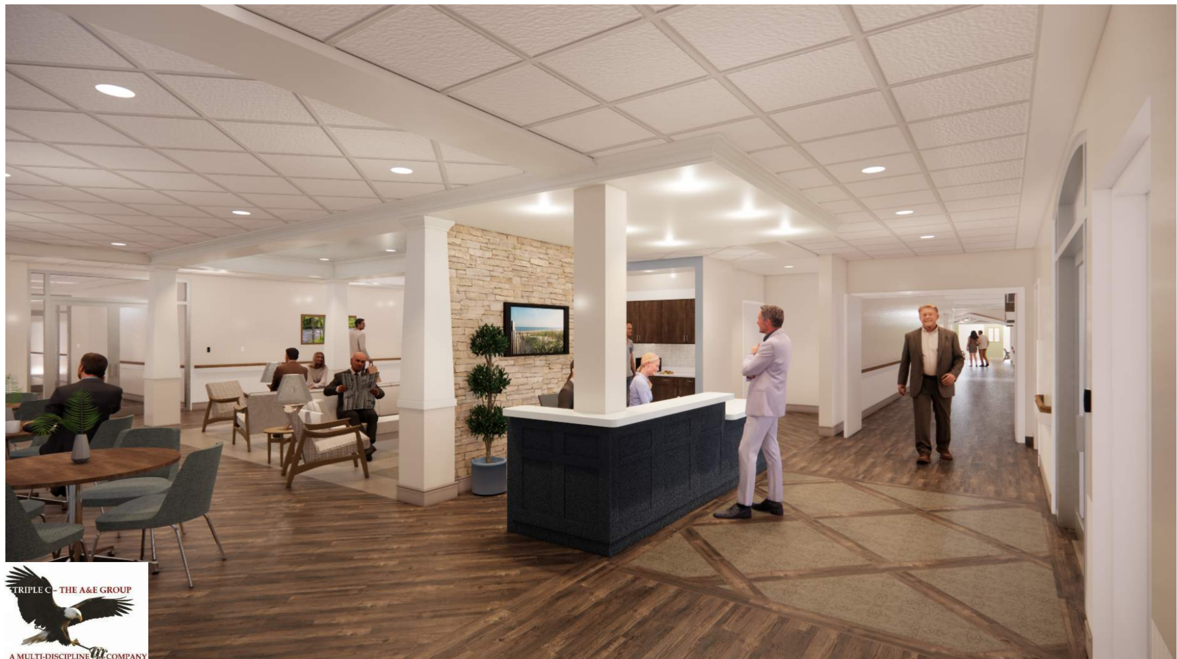
VIEW 2: FOYER