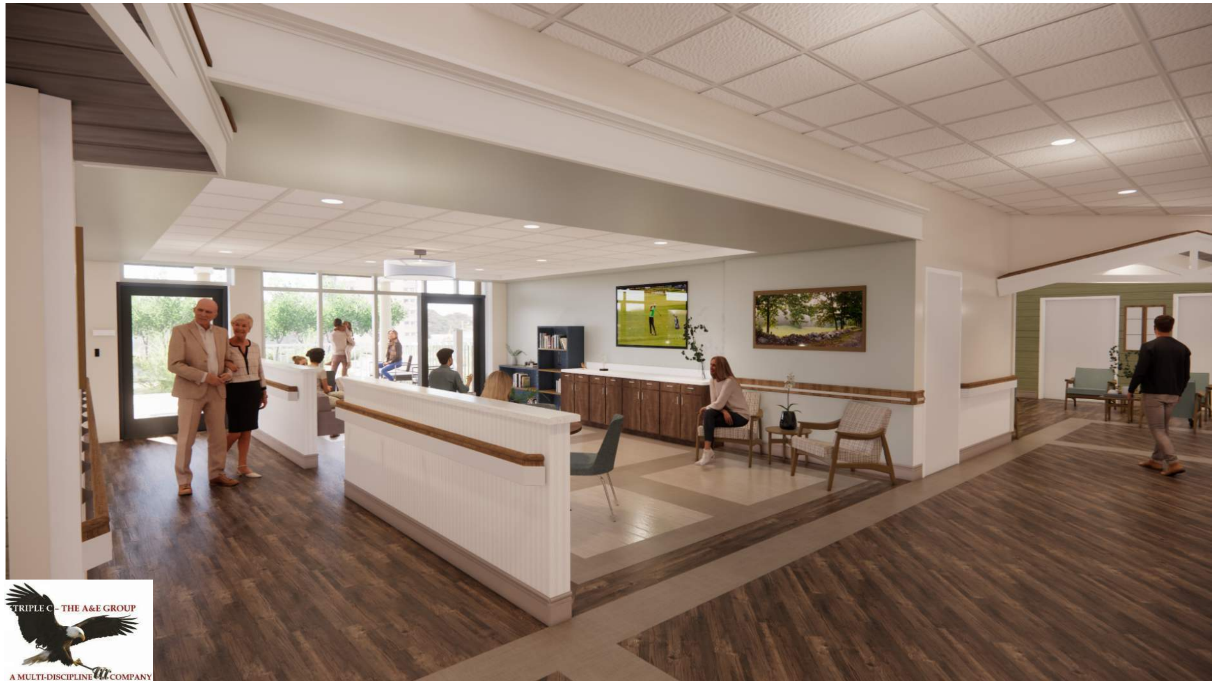
VIEW 7: TYPICAL RESIDENT LIVING ROOM