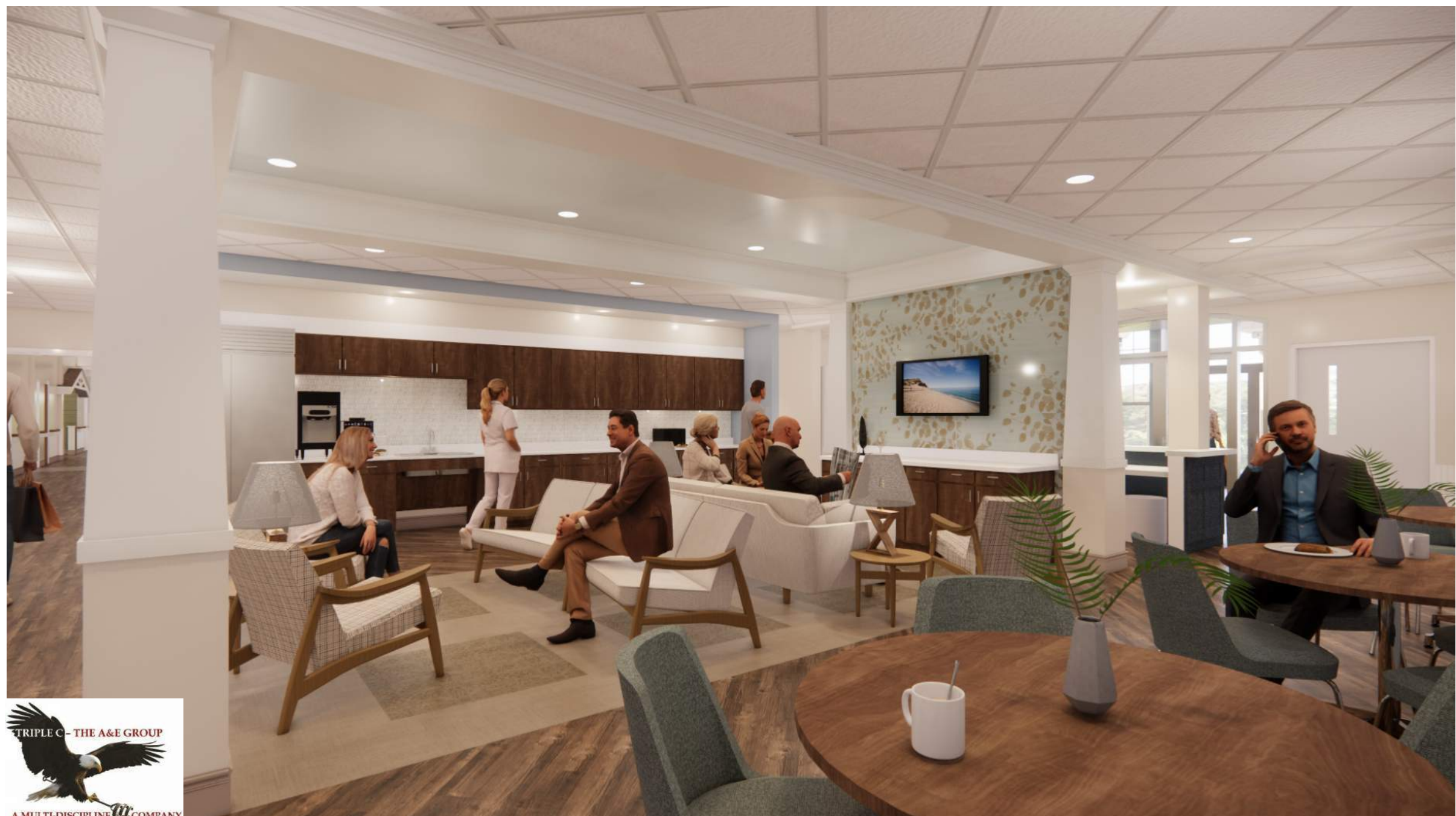
VIEW 3: ACTIVITY/ KITCHEN