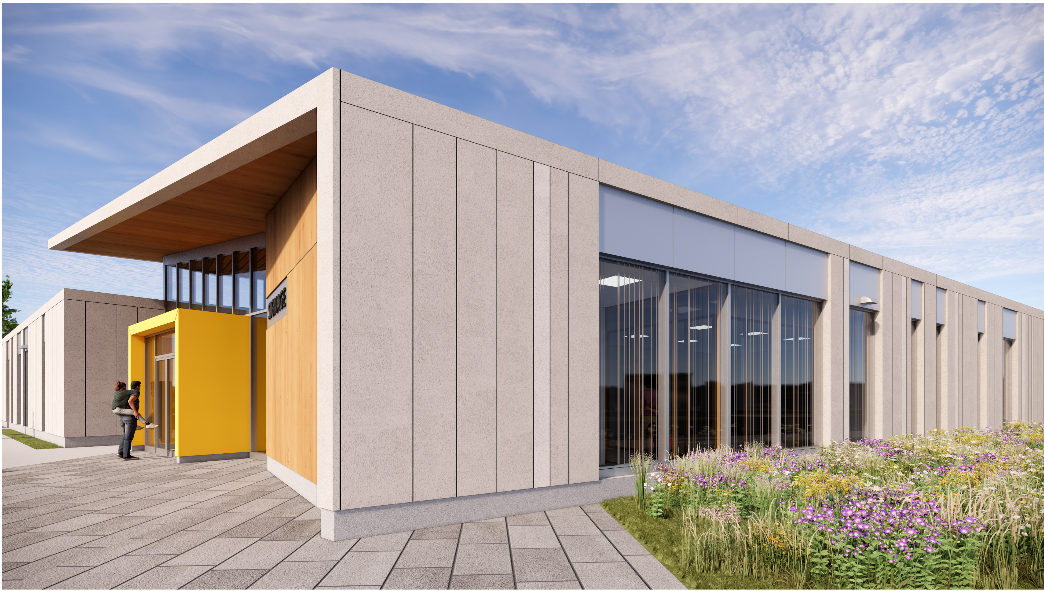
EXTERIOR PERSPECTIVE - FACADE DETAIL