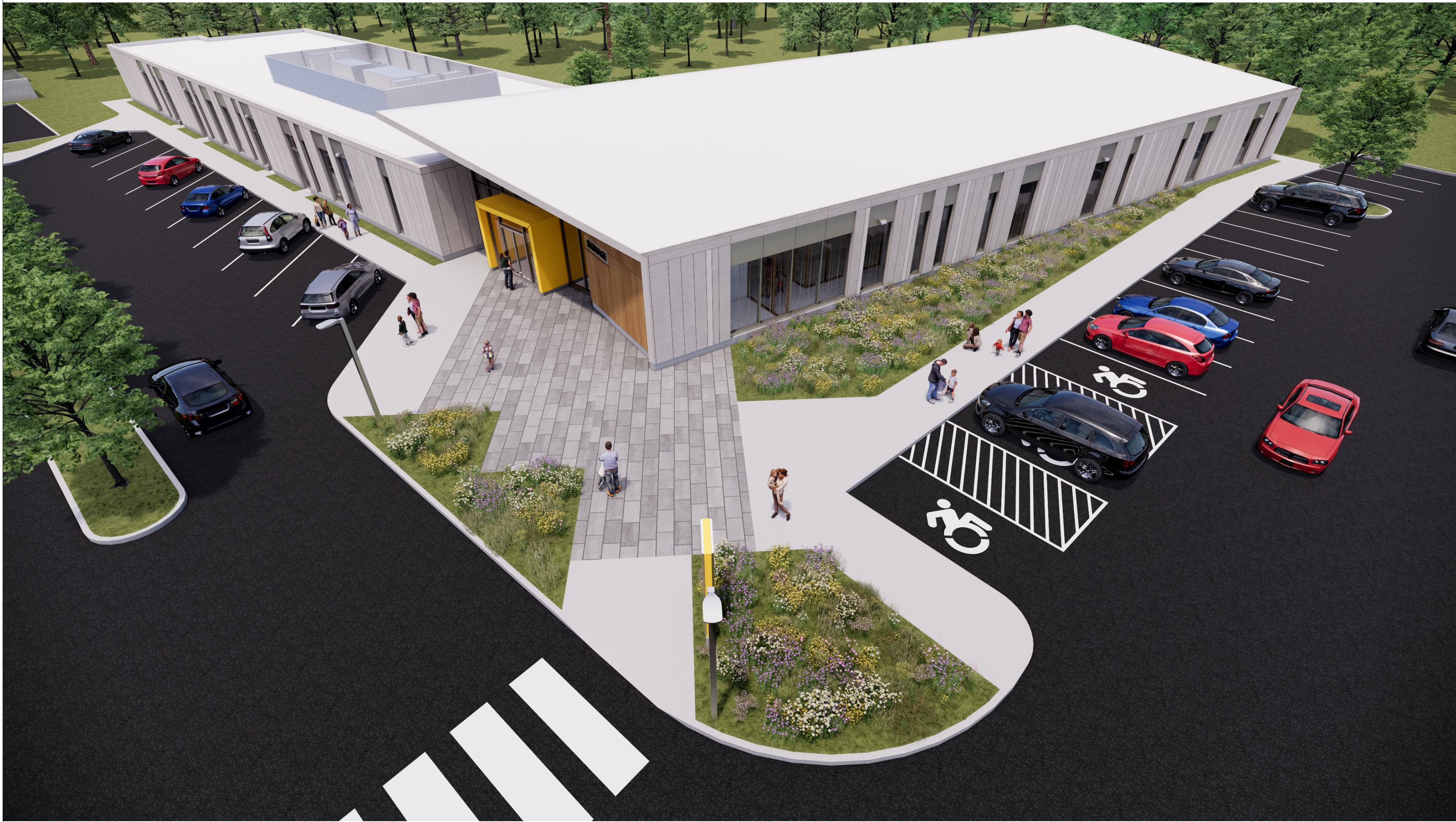
EXTERIOR PERSPECTIVE - AERIAL VIEW FROM THE SOUTHWEST