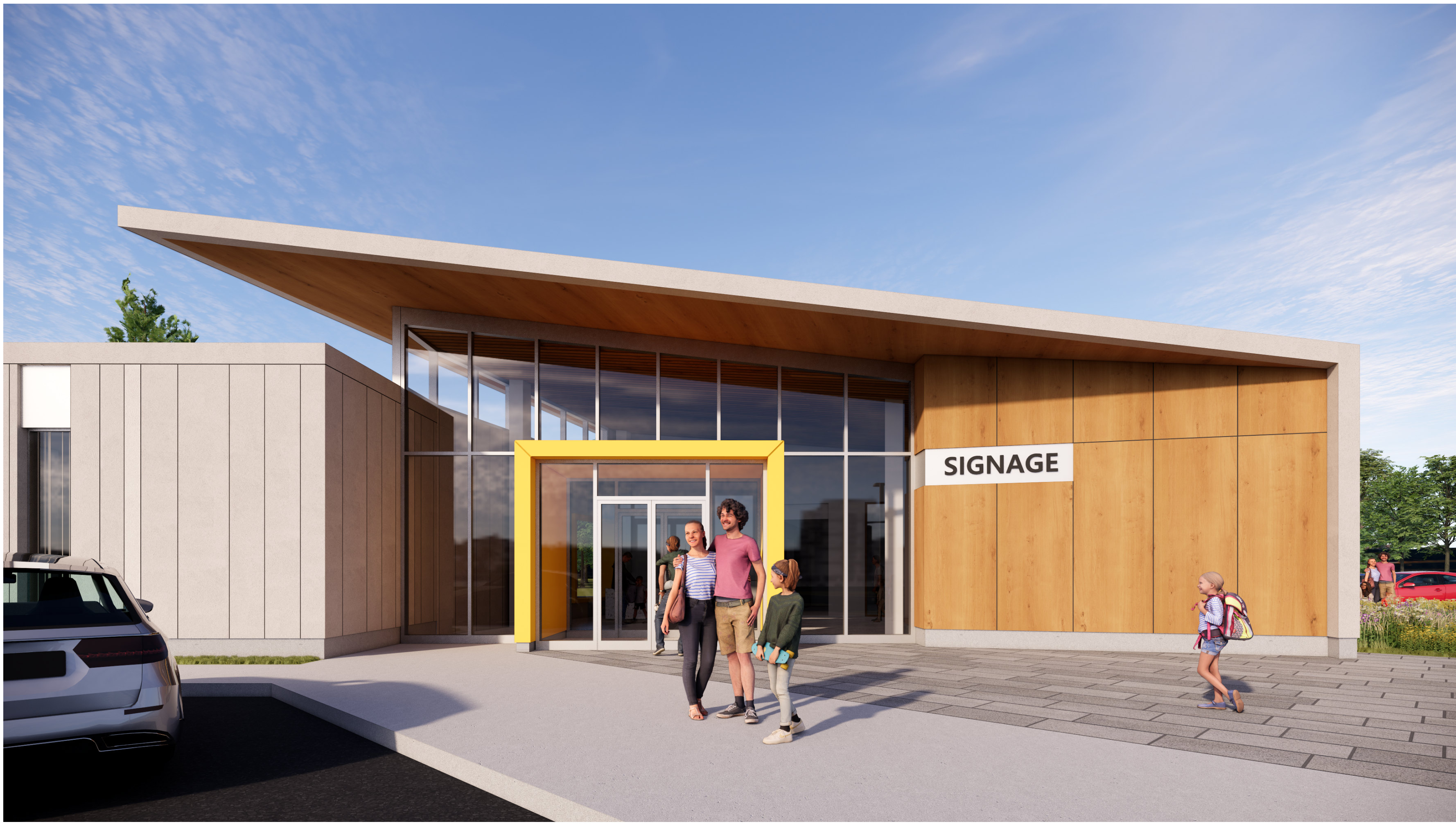
EXTERIOR PERSPECTIVE - MAIN ENTRANCE

1. RENDERINGS REFLECT LATEST DESIGN INTENT, HOWEVER DO NOT REFLECT ALL LATEST DESIGN DEVELOPMENT AND DETAILING.