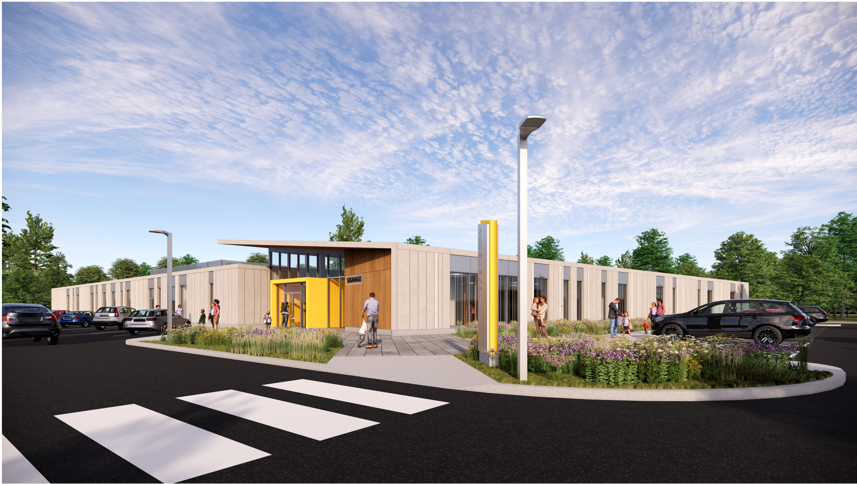
EXTERIOR PERSPECTIVE - MAIN ENTRANCE FROM THE SOUTHWEST