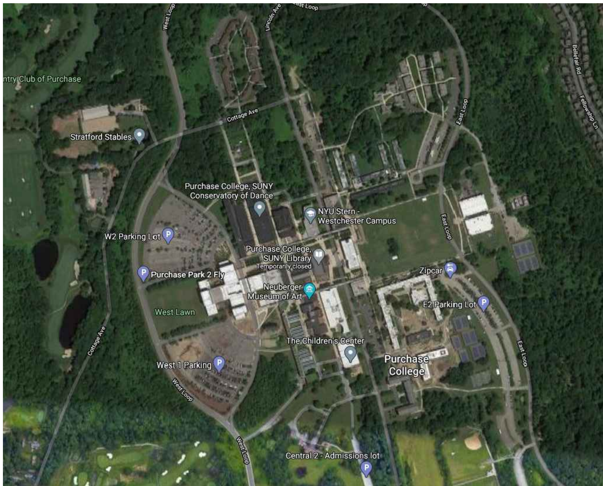
2 PURCHASE COLLEGE LOCATION MAP NTS