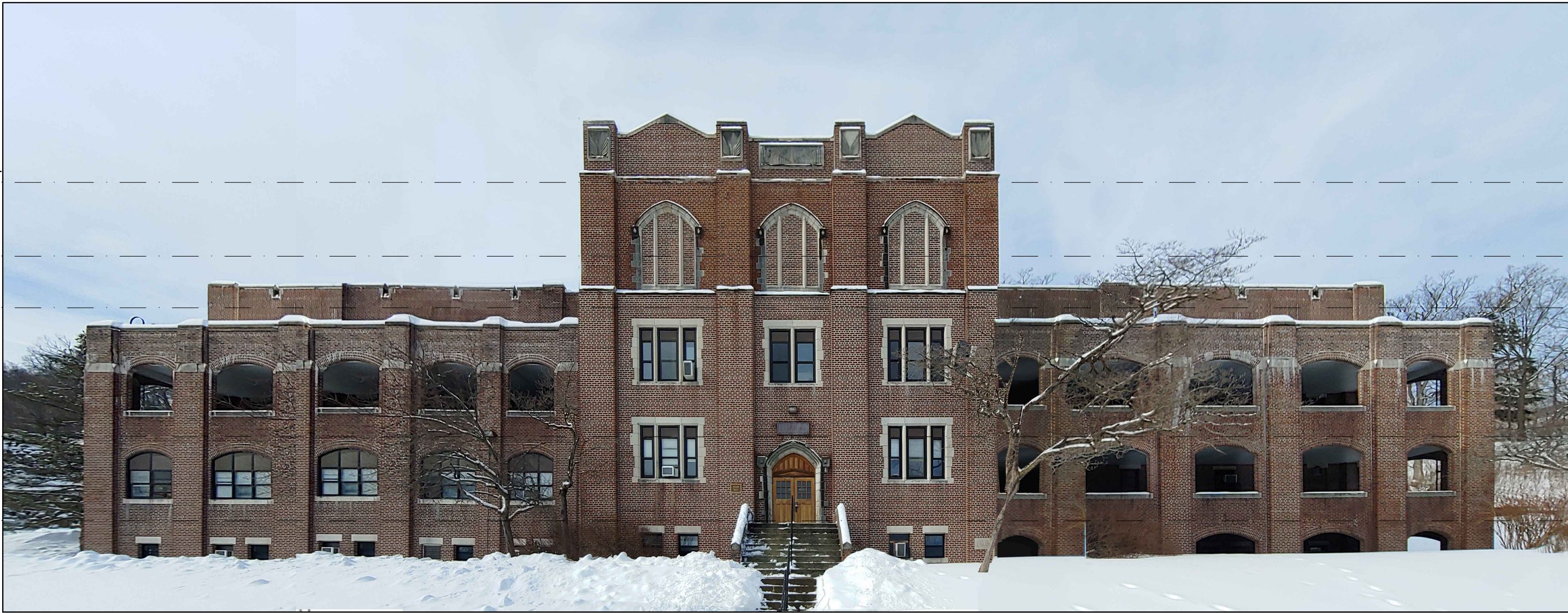
EAST ELEVATION COMPOSITE PHOTOGRAPH