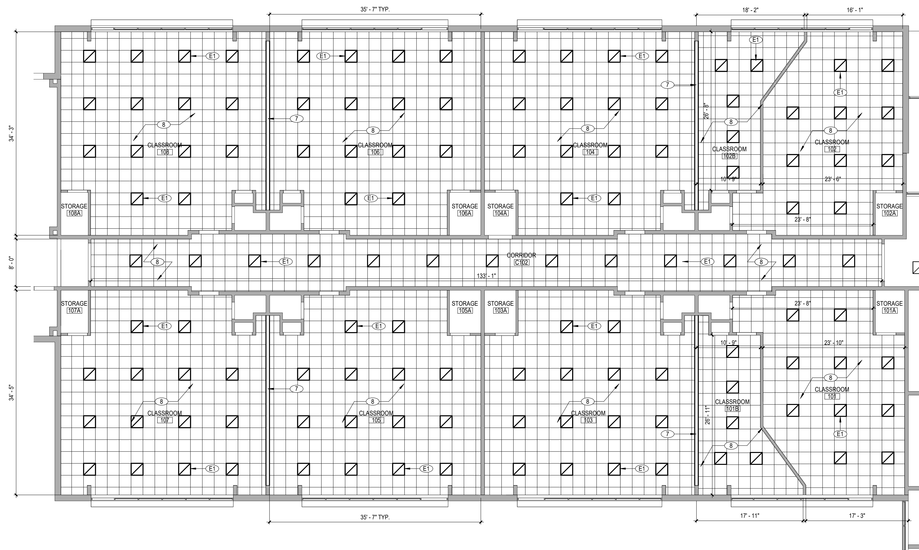
1 FIRST FLOOR NEW WORK RCP - AREA 'B'

(X) DESCRIPTION 7 PROVIDE PERMANENT PARTITION BETWEEN CLASSROOMS. REFER TO SECTION DETAILS. COORDINATE POWER REQUIREMENTS WITH ELECTRICAL DRAWINGS. 8 PROVIDE NEW ACT CEILING AS SPECIFIED, COORDINATE WITH MECHANICAL AND ELECTRICAL DRAWINGS. E1 LIGHT FIXTURE, TYPICAL. REFER TO ELECTRICAL DRAWINGS.