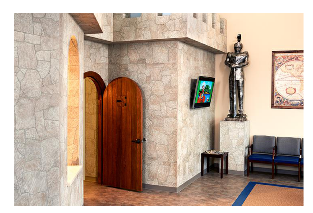
WAITING ROOM - SIM

NOTE: SEE SHEET E-200 - POWER PLAN - FOR ADDITIONAL INFORMATION ON POWER/DATA REQUIREMENTS.