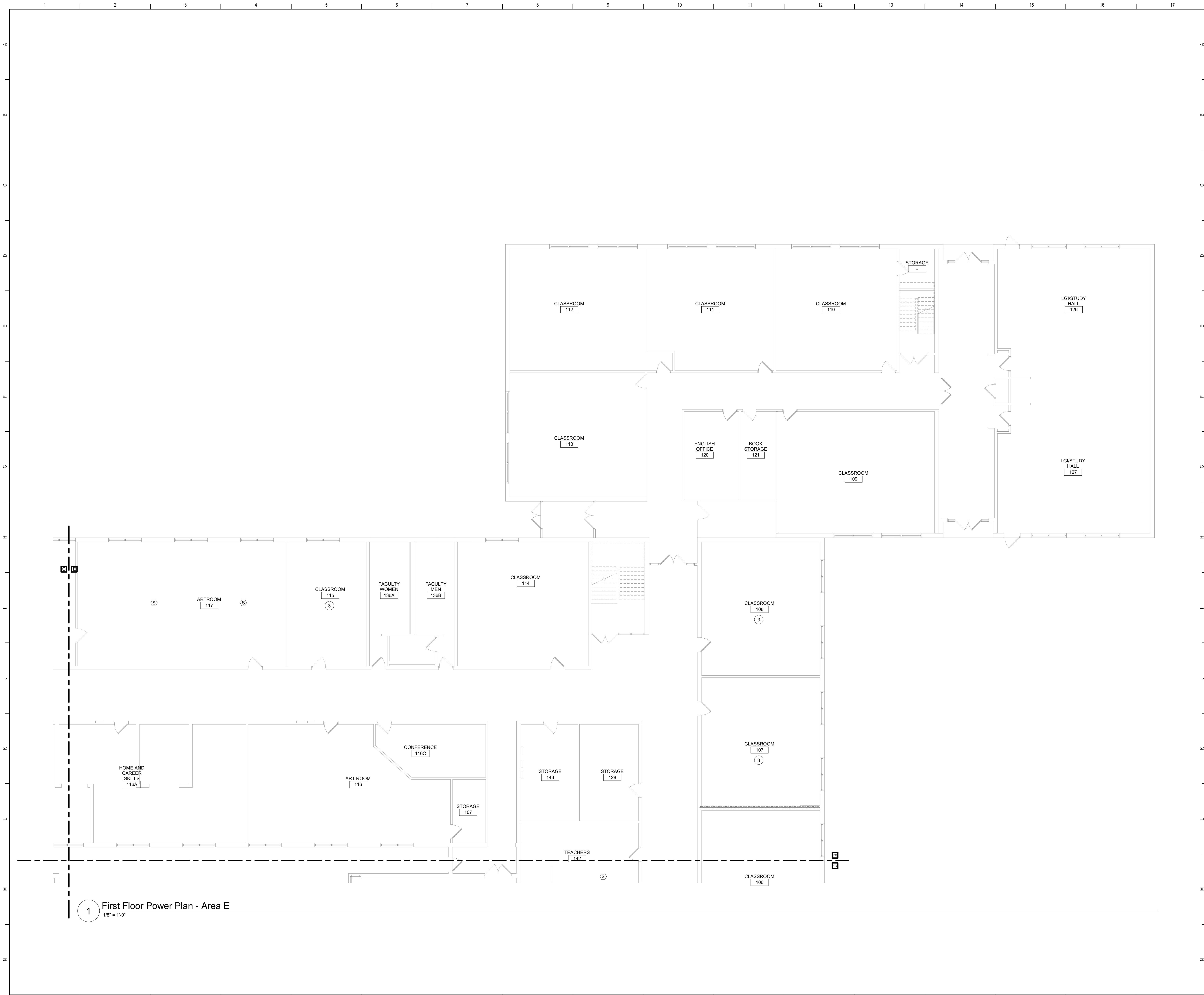
1 First Floor Power Plan - Area E 1/8" = 1'-0"