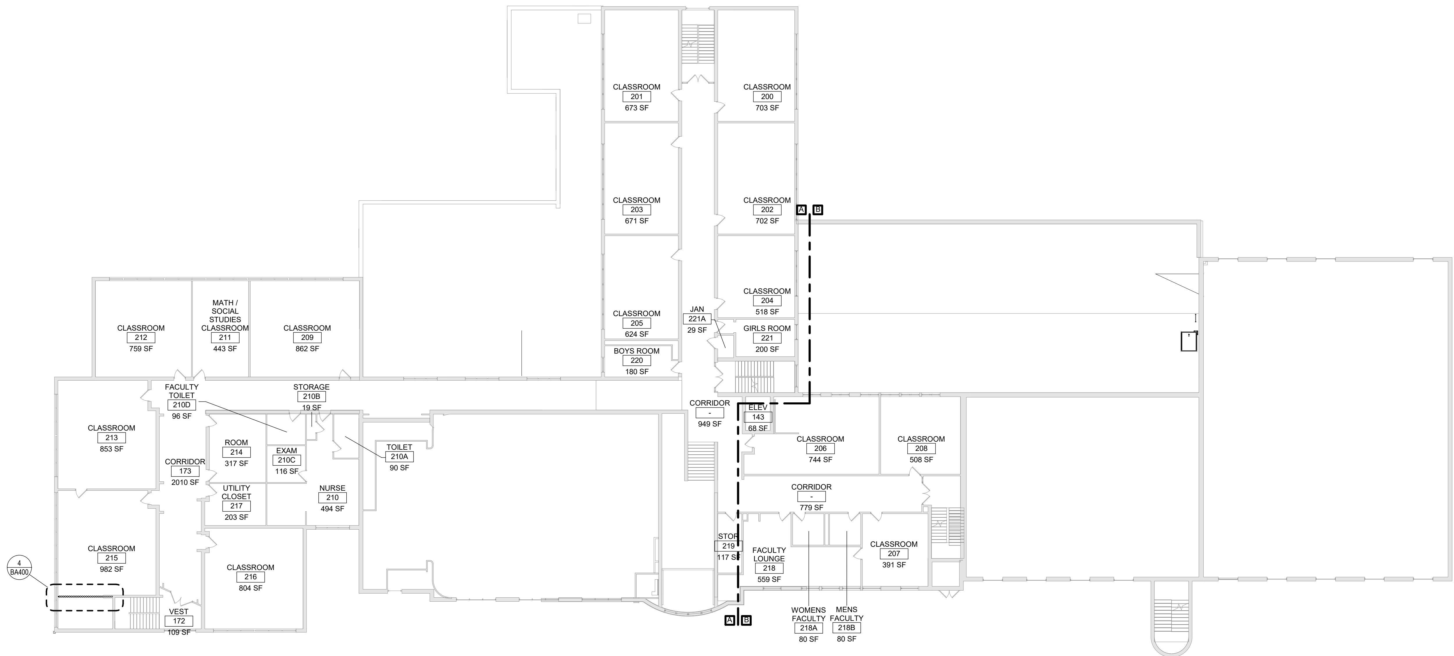
1 Second Floor Key Plan 1/16" = 1'-0"