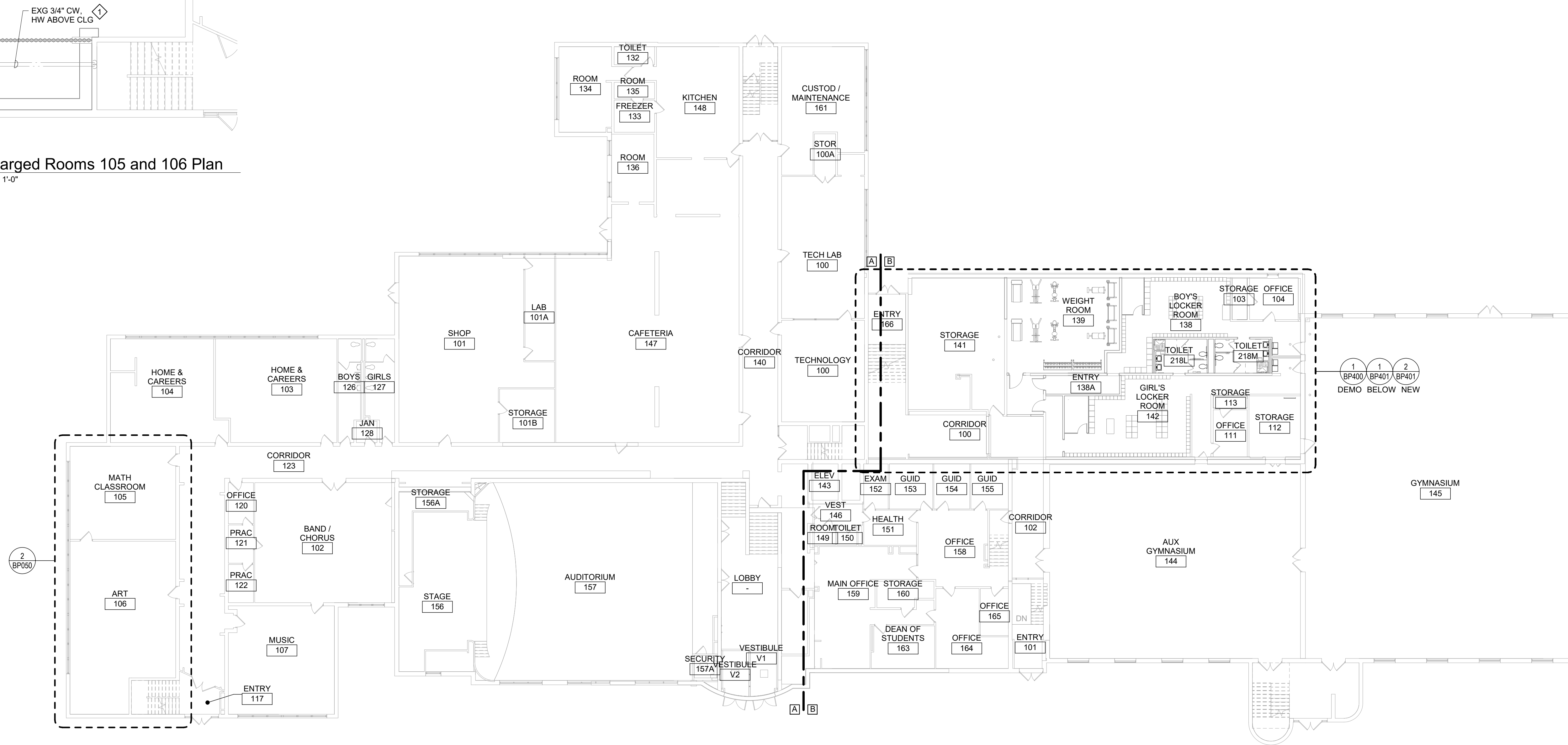
1 First Floor Key Plan 1/16" = 1'-0"