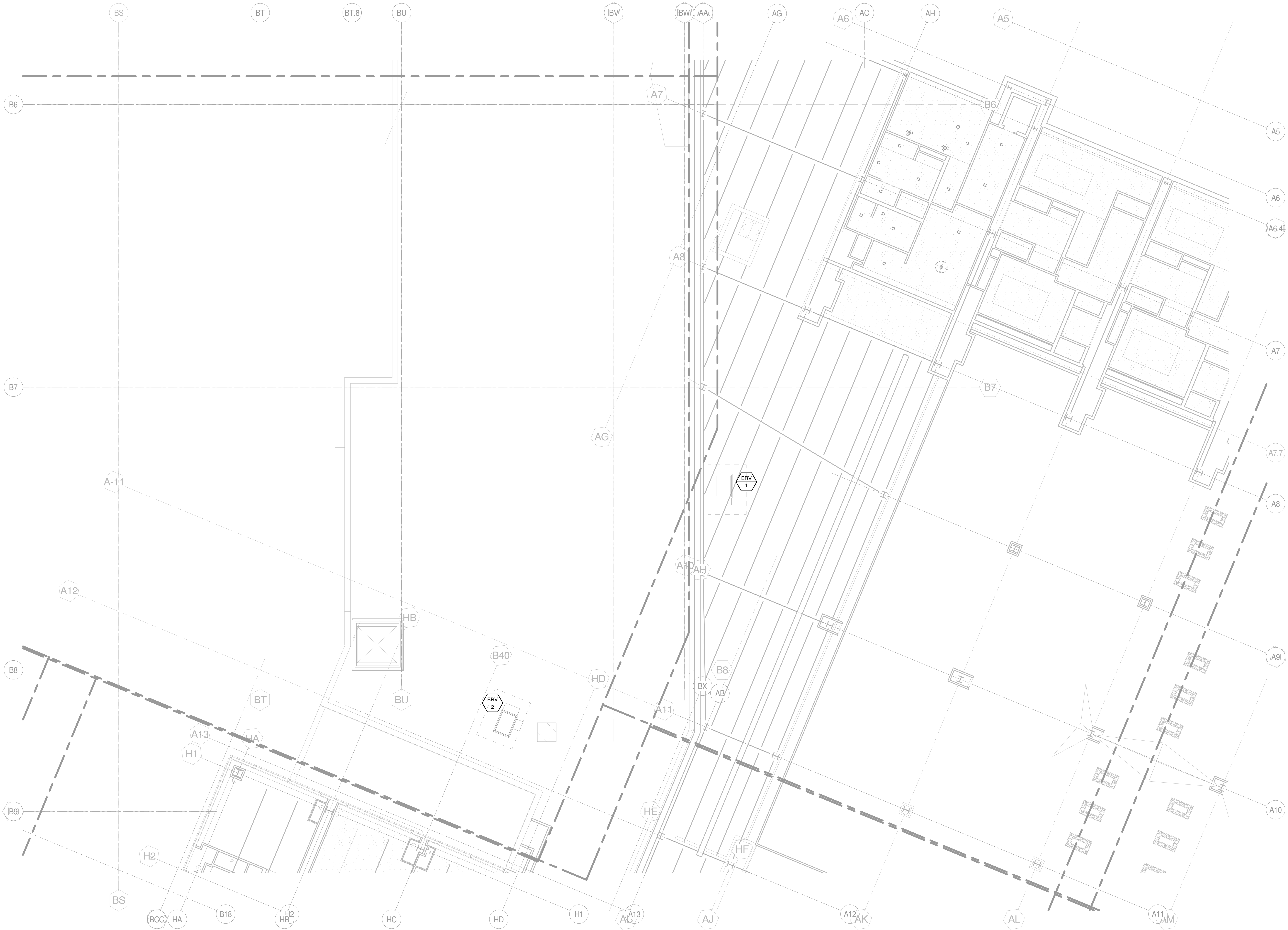
① ROOF POWER PLAN 1/8" = 1'-0"

1 FOR ELECTRICAL LEGEND AND GENERAL NOTES REFER TO DRAWING E-1. 2 FOR ELECTRICAL POWER ONE LINE & RISER DIAGRAMS, REFER TO DRAWINGS E-14 TO E-18. 3 FOR EXACT MOUNTING HEIGHTS OF ALL DEVICES REFER TO ARCHITECTURAL PLANS AND ELEVATIONS. MOUNT DEVICES IN A COMMON VERTICAL PLANE, AND PROVIDE MULTI-GANG 4 DEEP PLATES FOR ALL DEVICES. CIRCUIT NUMBERS SHOWN ON DRAWINGS ARE FOR DESCRIPTIVE PURPOSES ONLY. EXACT CIRCUIT NUMBERS SHALL BE DETERMINED IN THE FIELD. 5 ALL RECEPTACLES WITHIN CAFETERIA AND FOOD SERVICE AREAS SHALL BE GFI TYPE WITH WEATHERPROOF STAINLESS STEEL COVER.