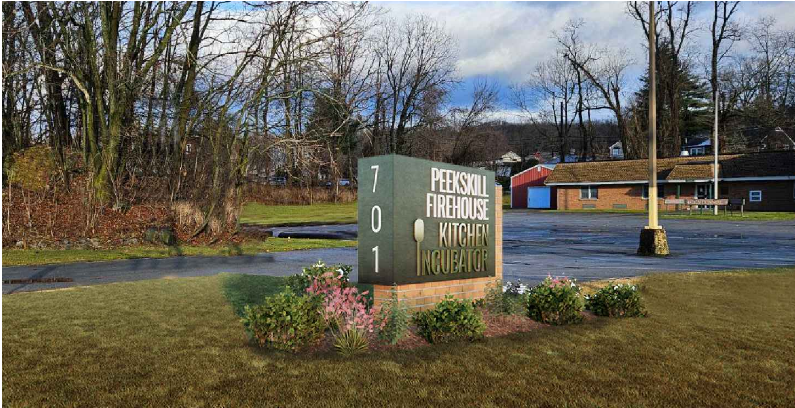
1 Monument Sign Renderings A5.02 Scale: NTS