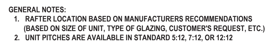
1 Skylight Details